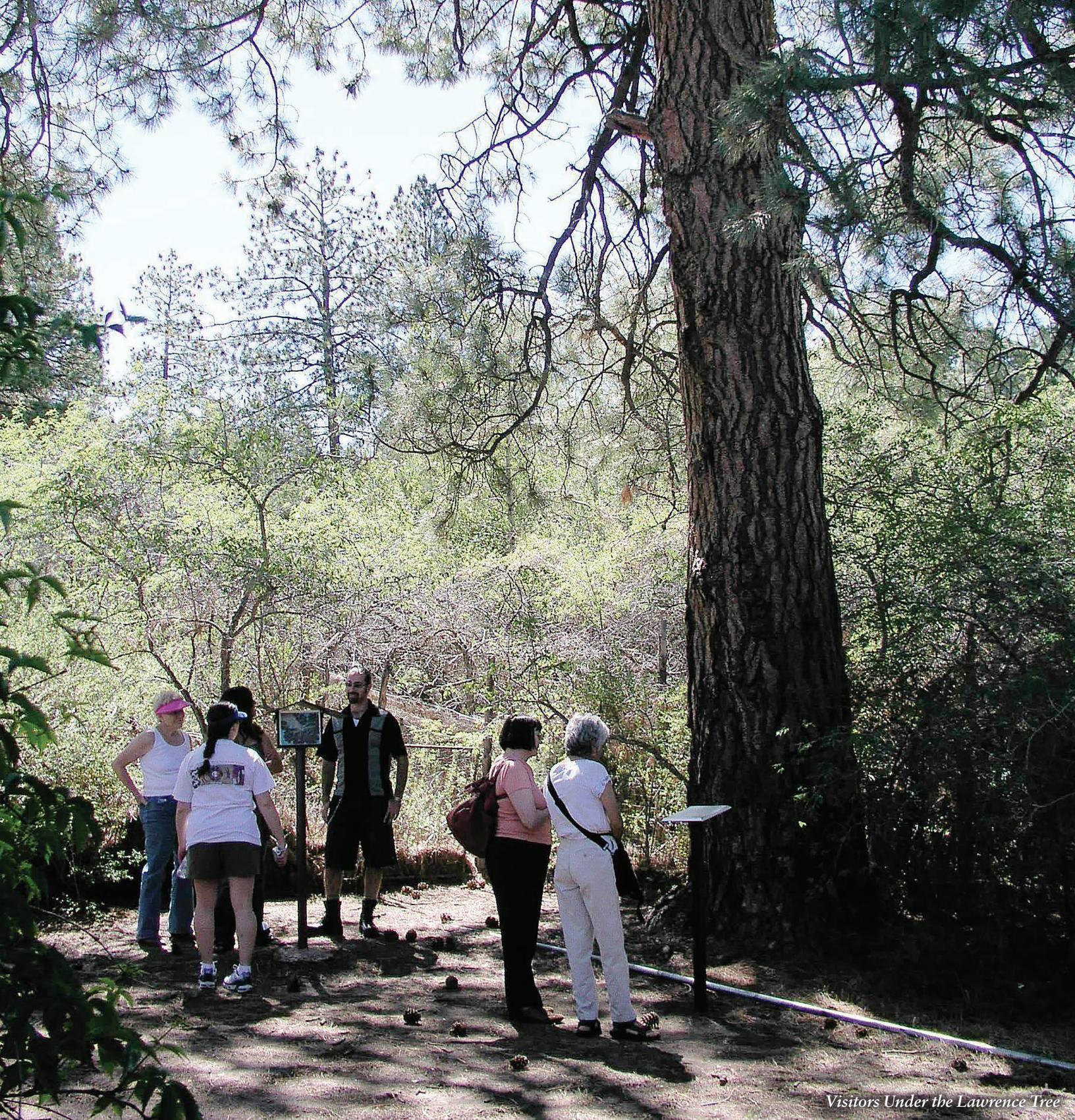
Visitors Under the Lawrence Tree