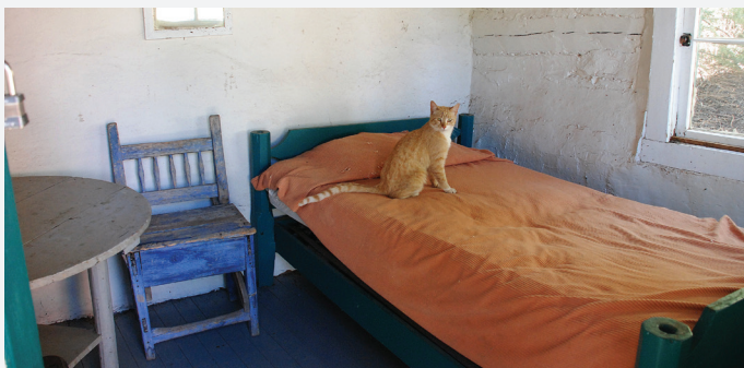
Interior Dorothy Brett Cabin

The D.H. Lawrence Ranch has the potential to become the arts center and retreat of the southwest. The vision is to build a visitor's center and other facilities so that the ranch can be used for educational and cultural activities as well as scholar and artist residencies. The 160-acre ranch could offer numerous programs ranging from anthropological field school to art studio courses,